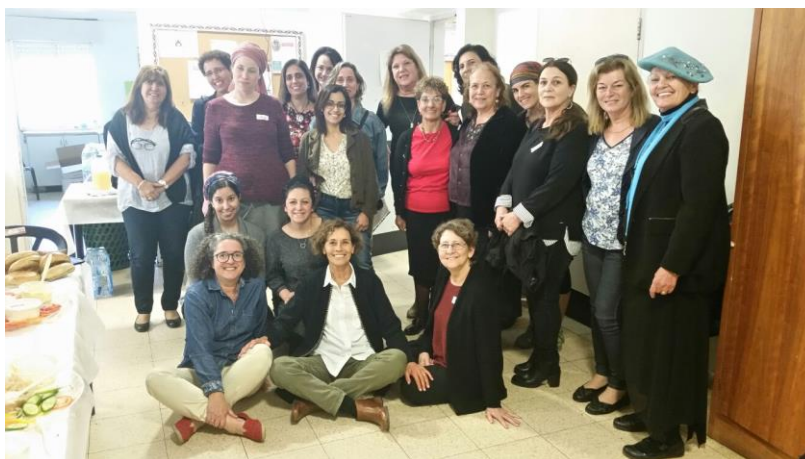
Mom to Mom coordinators from all over the country