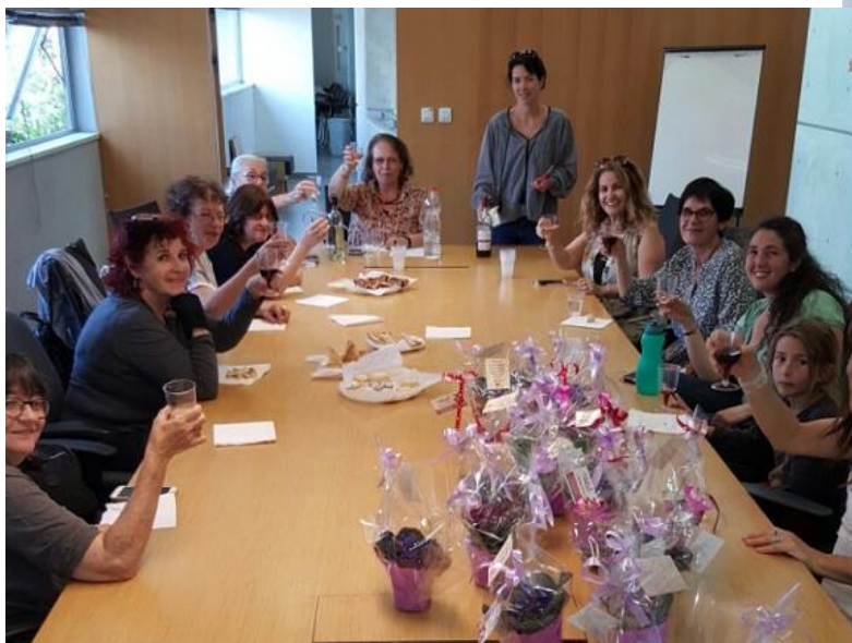
Mom to Mom volunteers meeting for Pesach