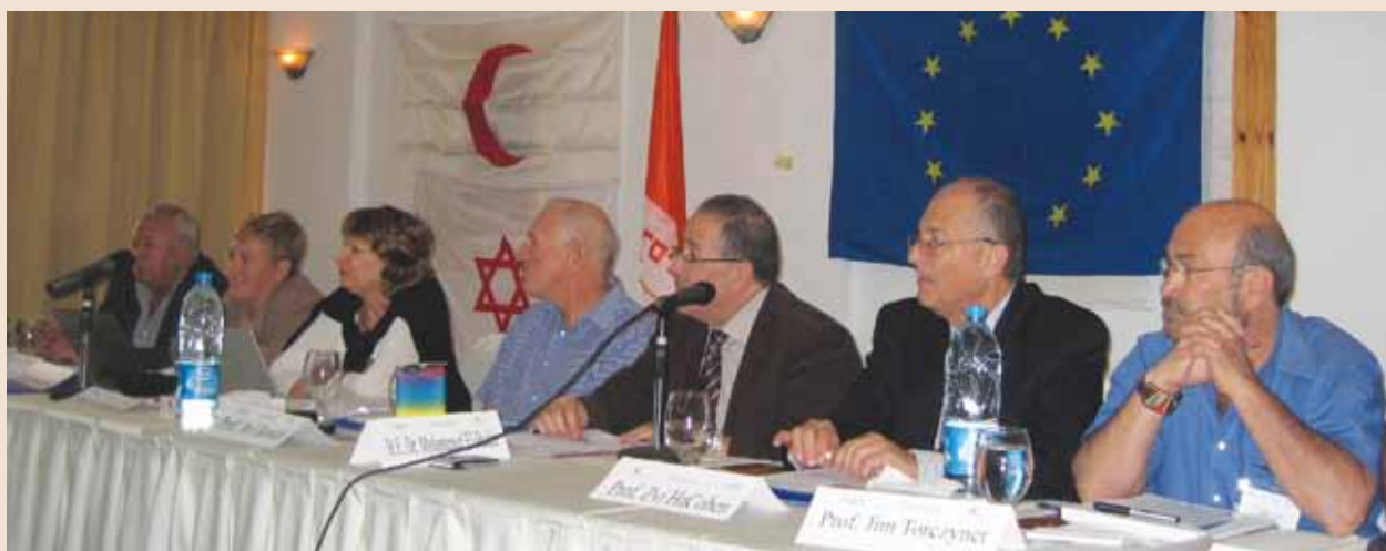
Participants of the DSF workshop