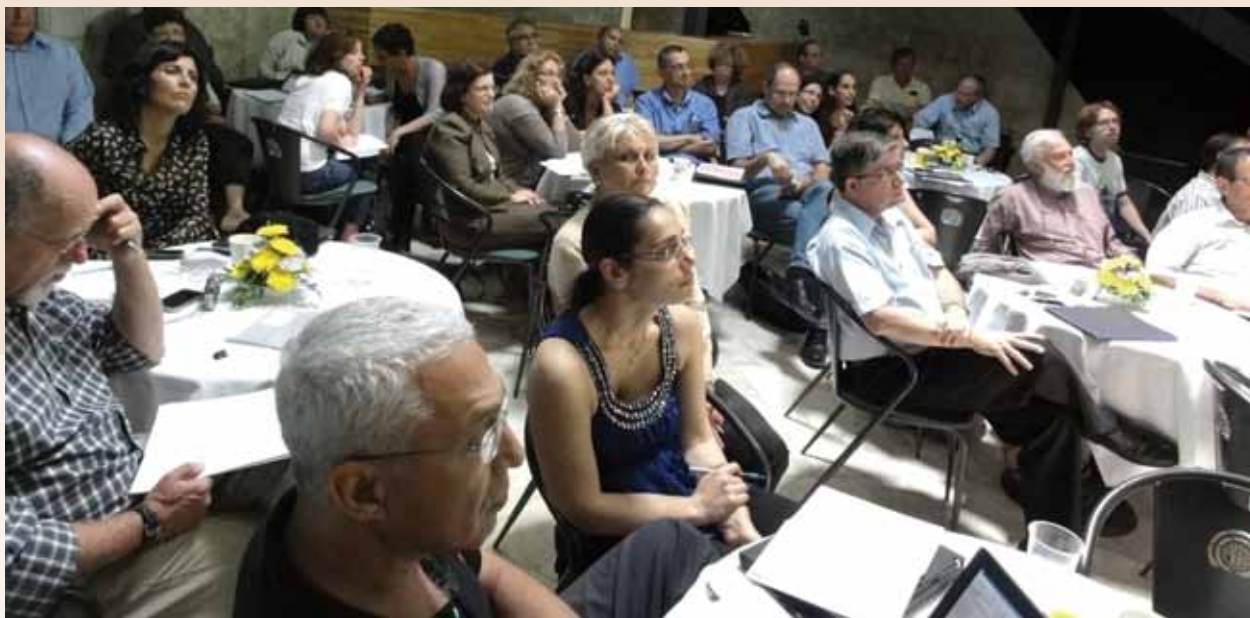
Participants of the Mitzpe Ramon Conference for Health Equity in the Negev

The Negev is developing rapidly, but the medical infrastructure must not be left behind. This was the message of the recently held Mitzpe Ramon Conference for Health Equity in the Negev, which was attended by Negev mayors and other officials, as well as health professionals.