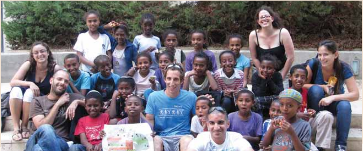
Faculty medical students with children from the "Aviv" outreach project

Twenty years ago, at the end of May 1991, the last of Ethiopia's entire 2,000-year-old Jewish community was brought to Israel in a dramatic airlift. In Operation Solomon, 14,400 Ethiopian Jews were flown out of Ethiopia in the midst of a civil war. It was a significant landmark as an earlier covert operation in 1984 (Operation Moses) was brought to an abrupt halt when news of the plan was leaked to the media, and Jews were no longer allowed to leave the country.