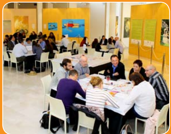
Conference attendants practicing large group intervention techniques