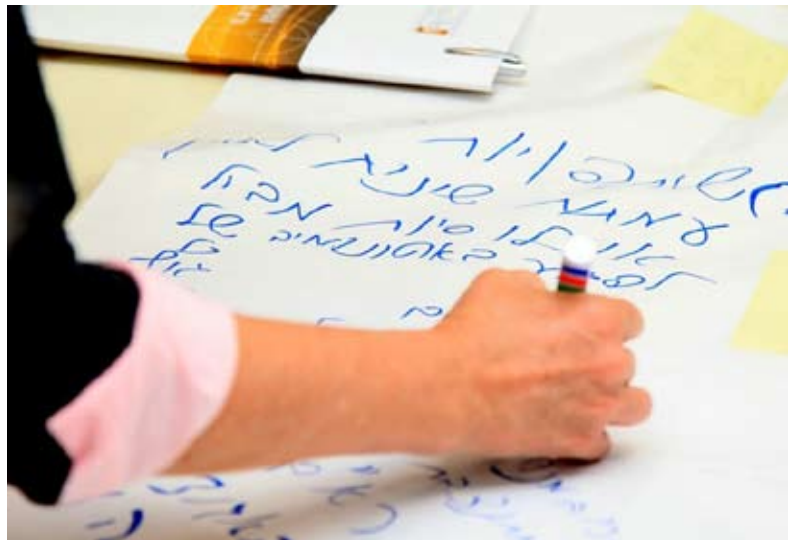
Leadership network meeting in action: discussing shared challenges

In addition to the Management Game, each student must join a Nonprofit Board. The governance of nonprofit organizations in Israel is often criticized as being unauthoritative, the weak link in the organization's management chain.