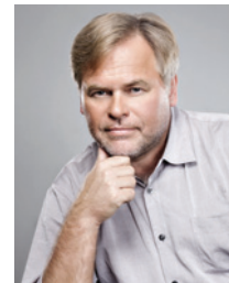
Eugene Kaspersky Chairman and CEO, Kaspersky Lab

In parallel to the exhibition, a unique conference will be held with outstanding international professionals. Here are some of the planned sessions: