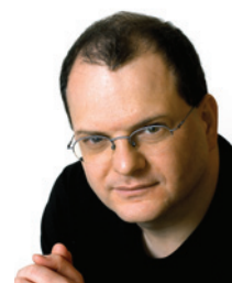
Gil Shwed Founder, Chairman and CEO, Check Point Software Technologies