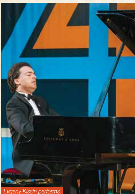
Evgeny Kissin performs

The honorary doctorate ceremony on Tuesday evening honored seven outstanding individuals. This year short movies highlighted the accomplishments of the evening’s honorees. They can be viewed online from the Board website, www.bgu.ac.il/board