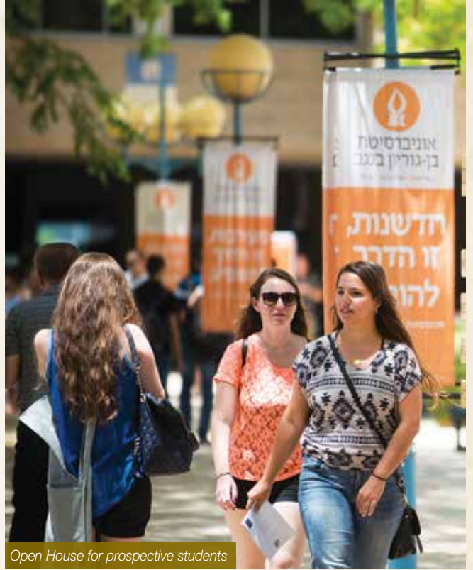
Open House for prospective students