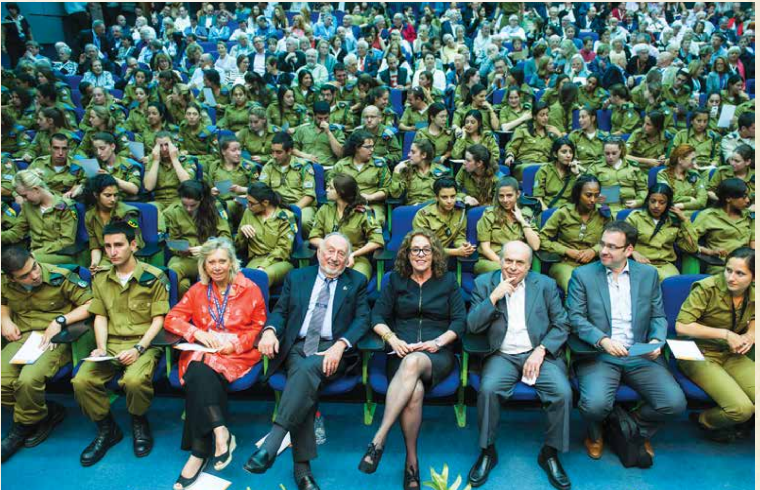
At the Evgeny Kissin concert: The audience, including members of the Israel Defense Forces and Chairman of the Executive of the Jewish Agency for Israel Natan Sharansky