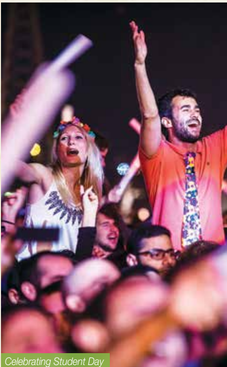
Celebrating Student Day