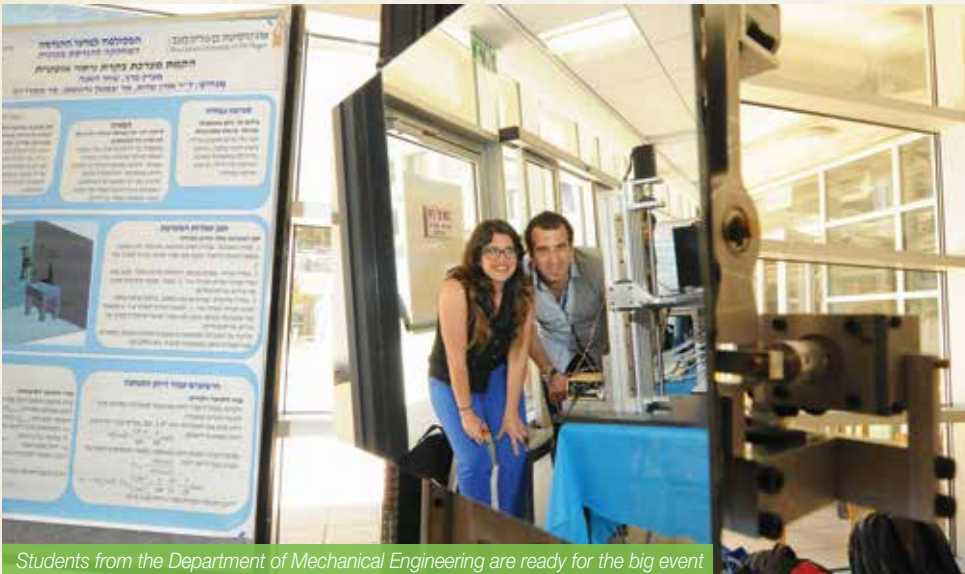
Students from the Department of Mechanical Engineering are ready for the big event