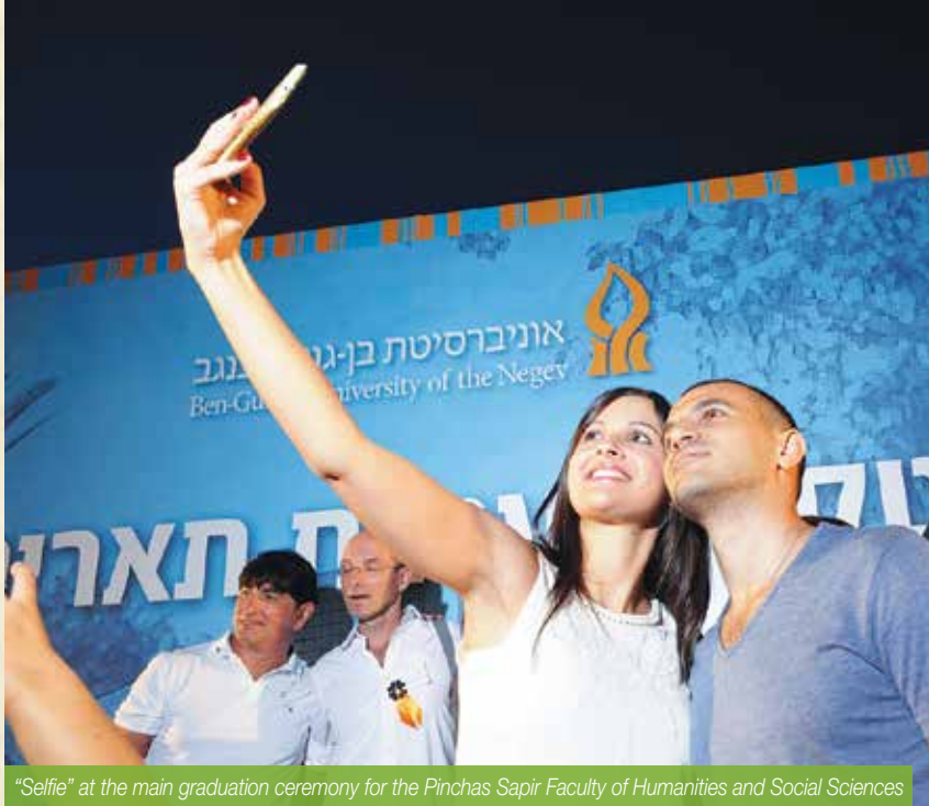
"Selfie" at the main graduation ceremony for the Pinchas Sapir Faculty of Humanities and Social Sciences