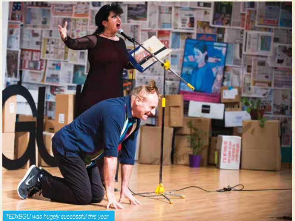
TEDxBGU was hugely successful this year