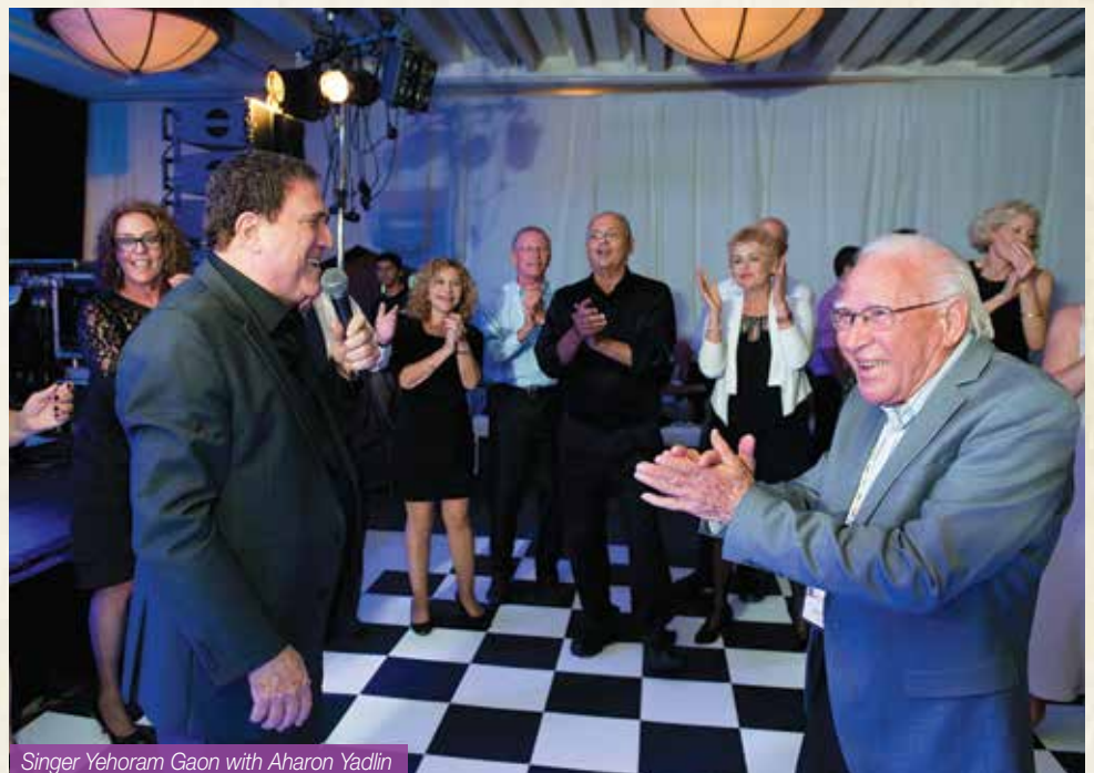
Singer Yehoram Gaon with Aharon Yadlin

For more information, visit our website at www.bgu.ac.il/board