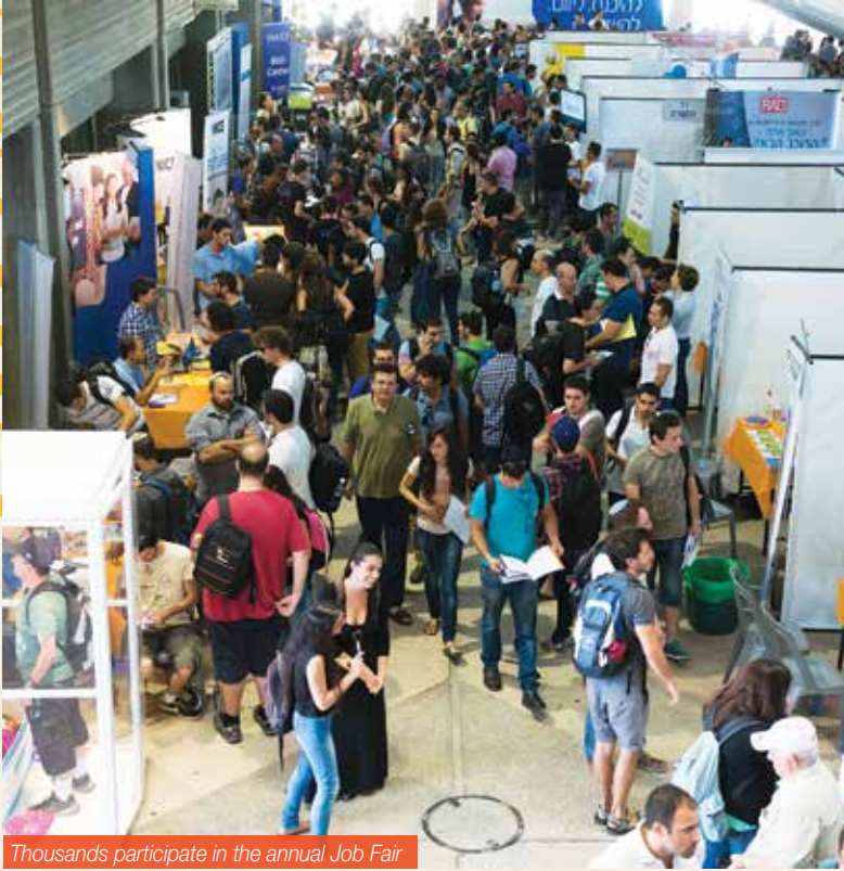
Thousands participate in the annual Job Fair