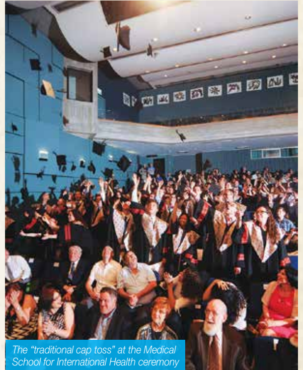
The "traditional cap toss" at the Medical School for International Health ceremony

In a series of lively ceremonies over a four week period, BGU granted more than 5,500 new degrees, including a record-breaking 208 doctoral degrees from the Kreitman School of Advanced Graduate Studies.