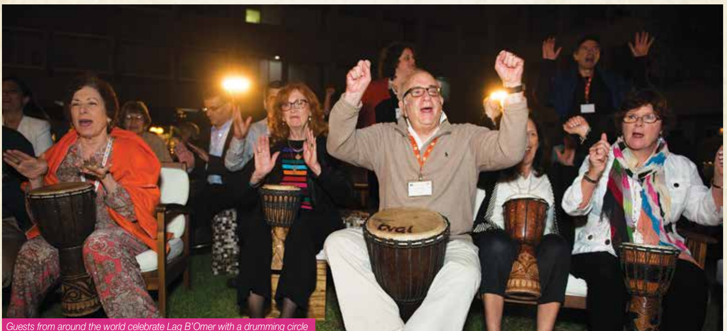
Guests from around the world celebrate Lag B'Omer with a drumming circle