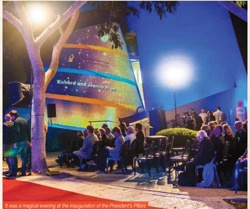
It was a magical evening at the inauguration of the President's Pillars