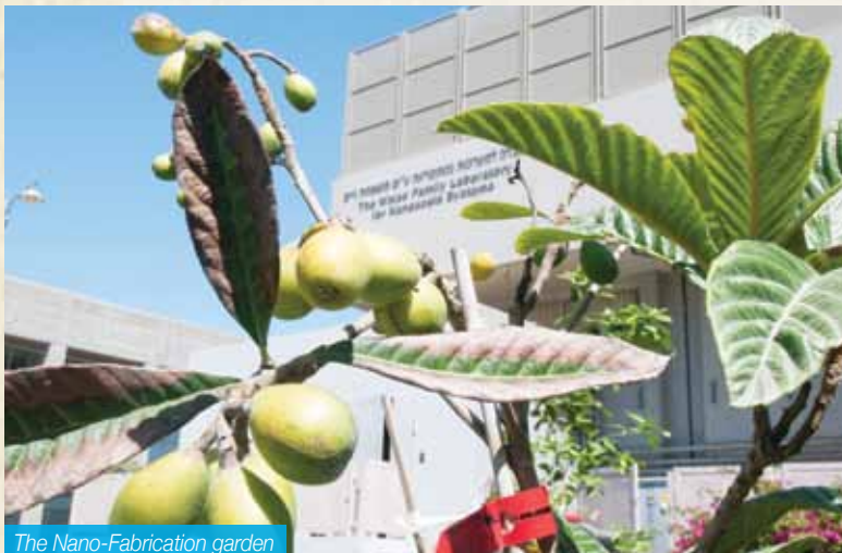
The Nano-Fabrication garden