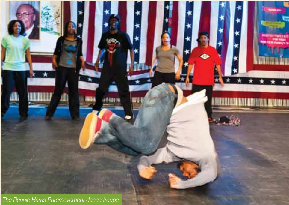
The Rennie Harris Puremovement dance troupe

From a hip-hop dance troupe to the young ambassador to Israel, America Day splashed red, white and blue all over the Zlotowski Student Center. Informational booths offered interested students insight into everything from USAID to study abroad options and all the other services of the American Embassy.