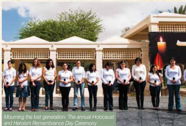
Mourning the lost generation: The annual Holocaust and Heroism Remembrance Day Ceremony