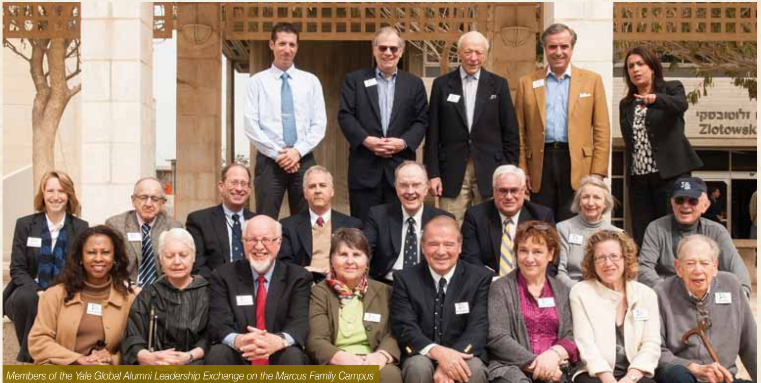
Members of the Yale Global Alumni Leadership Exchange on the Marcus Family Campus

When you have been around for 310 years and your first class reunion was in 1792, there's a lot to teach a young university like BGU. So when a delegation from Yale University came to offer a little coaching on alumni relations, the participants were very attentive.