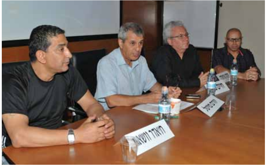
"Art and Protest in the Middle East," roundtable

Love Stories in Conflict Zones: Personal Oral Stories; Letters and Postcards; Narratives of Love Stories in the Public Sphere