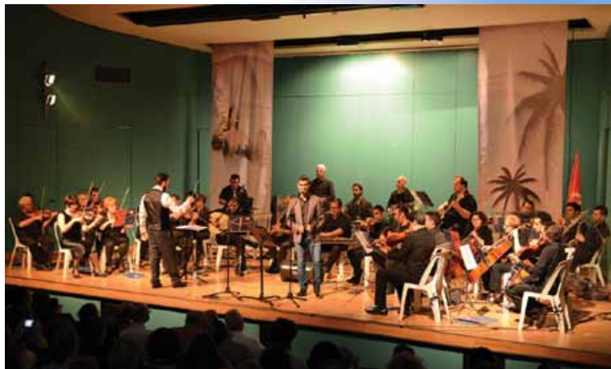
The Andalusian Mediterranean Orchestra of Ashkelon