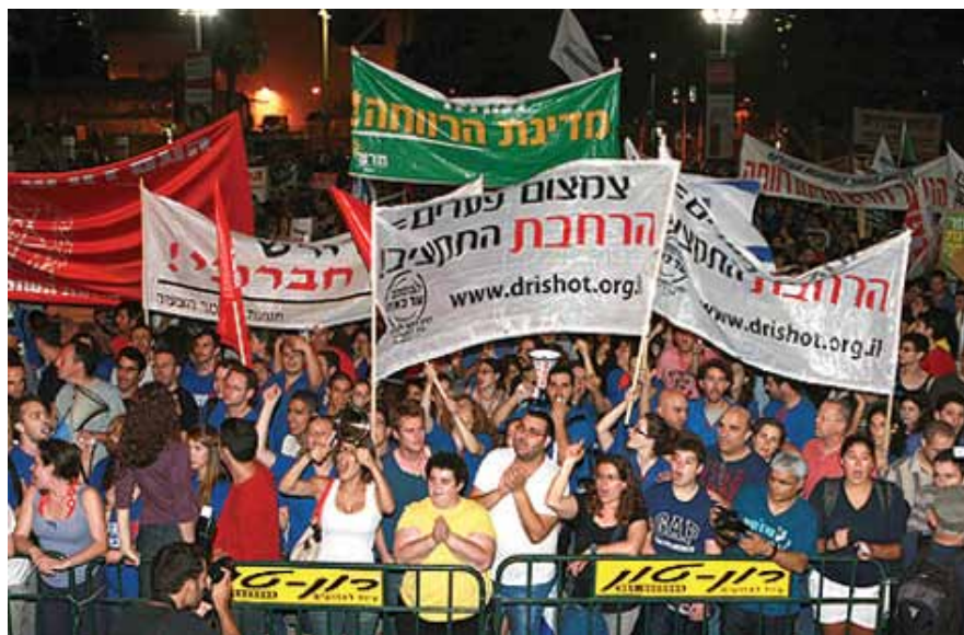
"The People demand social justice," Tel-Aviv, August 2011