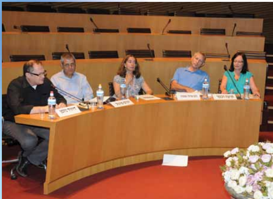
"When the Canons Fall Silent," opening session

October anniversary stamp that always contains Egyptian national symbols, the October Panorama, the war museum commemorating "the crossing," as well as speeches and ceremonies constantly referring to Egypt's achievements in the spirit of "the crossing" seen as a historical milestone. Over the years all of them have been used for the political purposes of the present leadership, be it at the time of President Mubarak, who, among other things, switch the myth of heroism from Sadat to the Egyptian army, in which Mubarak served, or at the time of President Morsi, who in a picture commemorating the war, added not only his own image but also those of members of the Muslim Brothers (who were persecuted by Sadat and Mubarak) and of al-Jama'a al-Islamiya , to which Sadat's assassins belonged.