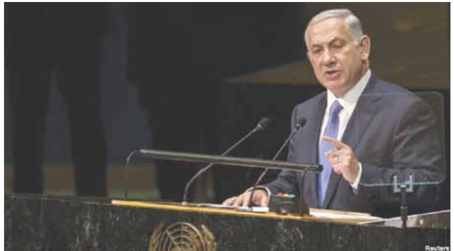
PM Netanyahu at the UN, November 2014

T wenty-one years after the signing of the 'Declaration of Principles on Interim Self-Government Agreements' ("Oslo Accords"), the relations between Israel and the Palestinian Authority are in a state of perpetual crisis. The causes of the crisis and the reasons for its continuation are manifold and diverse. However, each side has one contention regarding the main reason for not achieving a final status agreement ending the bloody historical conflict. President Mahmoud Abbas