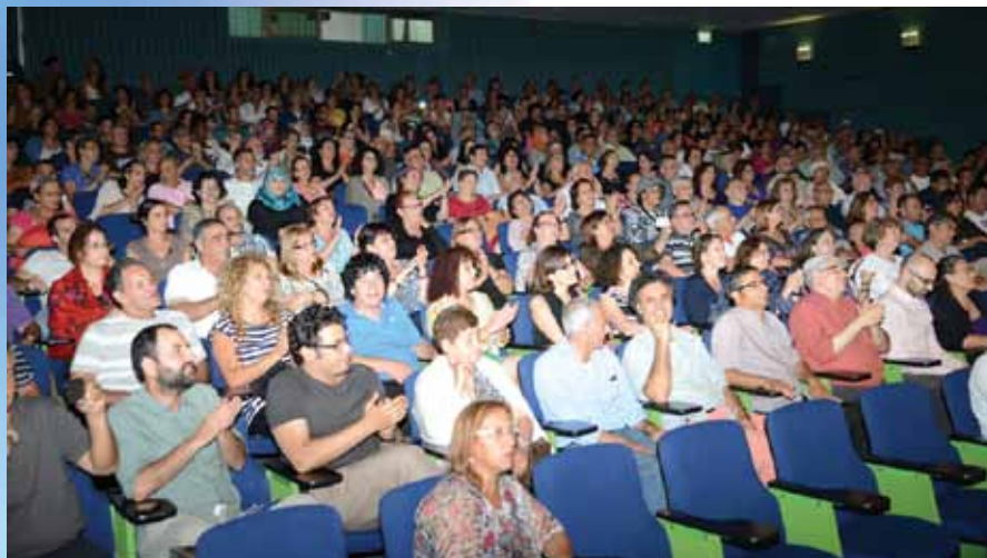
Umm Kulthum Forever, May 2014

taken in by it and later decided to study Arabic language and the rules and styles of classical Arabic music. The concert focused on the musical creations of the giants among Egyptian singers, in particular Umm Kulthum, Mohammed Abdel Wahab, and Farid al-Atrash. The impressive performance won enthusiastic applause. The orchestra's composition, and especially the soloists' biographies, fit well into the framework of the workshop; the concert was a perfect closing event. ♦