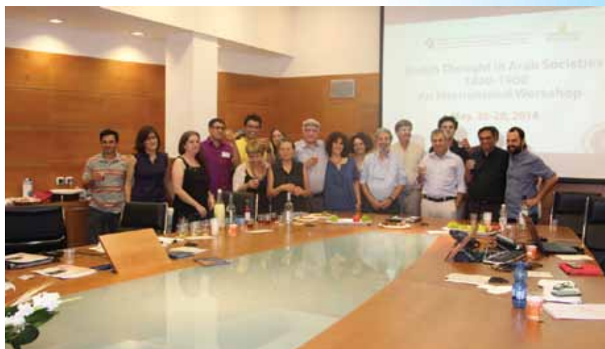
Participants of the workshop "Jewish Thought in Arab Societies 1880-1960"