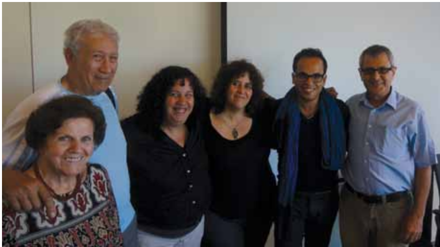
"Tinghir-Jerusalem" screening, May 2013

pain about the displacement and the loss of a distant world, while some even expressed their feeling of alienation in Israel, especially at the beginning, in light of the difficulties of integration. It turns out that many children of Jews who left Tinghir to live in Israel are interested in their parents' past and document their history in Morocco.