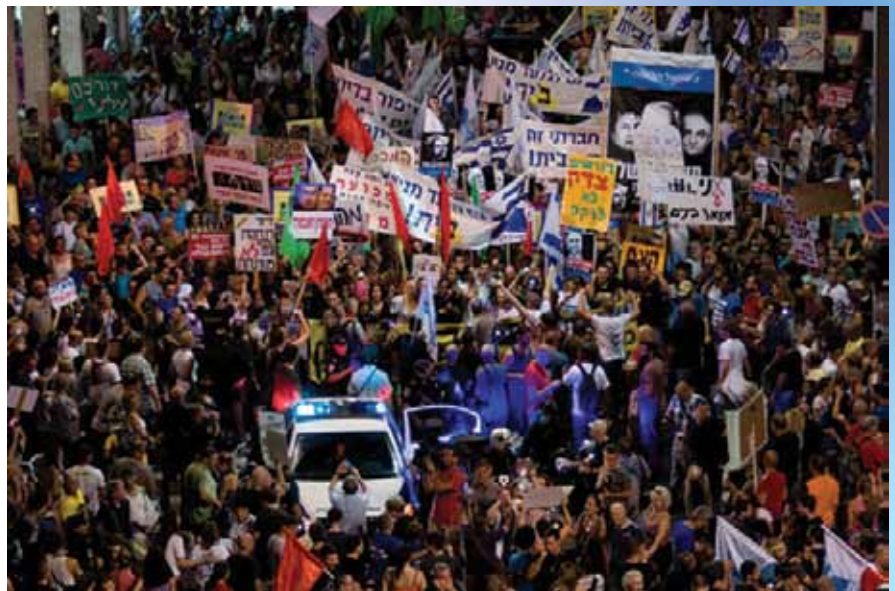
Social protest in Tel-Aviv, August 2011