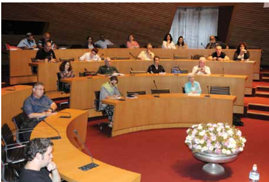
"When the Canons Fall Silent," November 2013