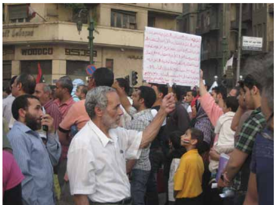
Tahrir Square, May 2011

Another issue stemming from prevalent methodological assumptions is the impression of overwhelming public support for Islamist parties, such as Ennahda in Tunisia. As the Muslim Brothers in Egypt, Ennahda won the elections and heads the state, but the election victory does not accurately reflect its support among the population, which is actually much more limited. This raises a