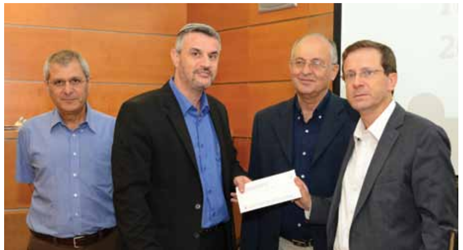
Annual Scholarships Awards 2014