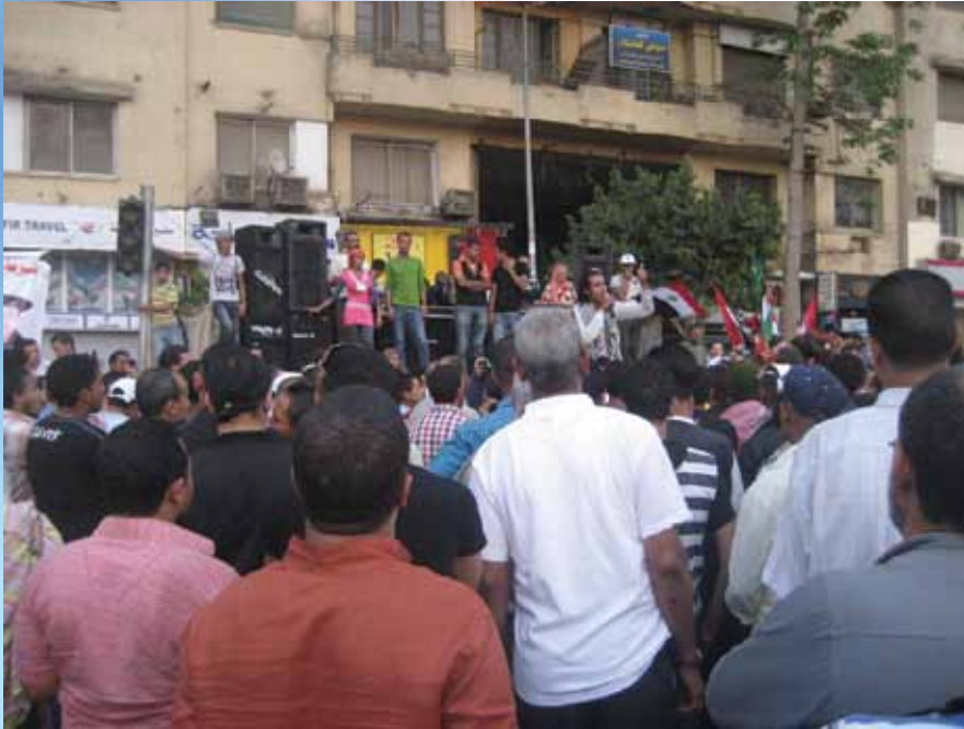
"The People demand social justice," Cairo, August 2011

a rhetoric opposing ethnicity and hiding behind that a more important social class issue. In contrast to the French case, the core group of the protest in Israel belonged to the middle class, educated young people, who are not wealthy, in relative terms. Pierre Bourdieu would define this group as having much cultural capital, and relatively little material capital. This group spoke in the name of the people and attracted the middle class and the periphery; but it remained a middle-class protest, leaving many groups outside, such as the ultra-Orthodox, the national-religious, and the working class. It was the first protest against the liberal revolution that centers on Netanyahu's privatization policy, and against the breach of the Republican social contract which obliges the state to ensure welfare, education, health care and housing for the middle class. This is a class that has retreated from political and public involvement to the private domains of high-tech and making money, and that is connected with the global elite and Israeli capital in their support of the neo-liberal revolution. Although