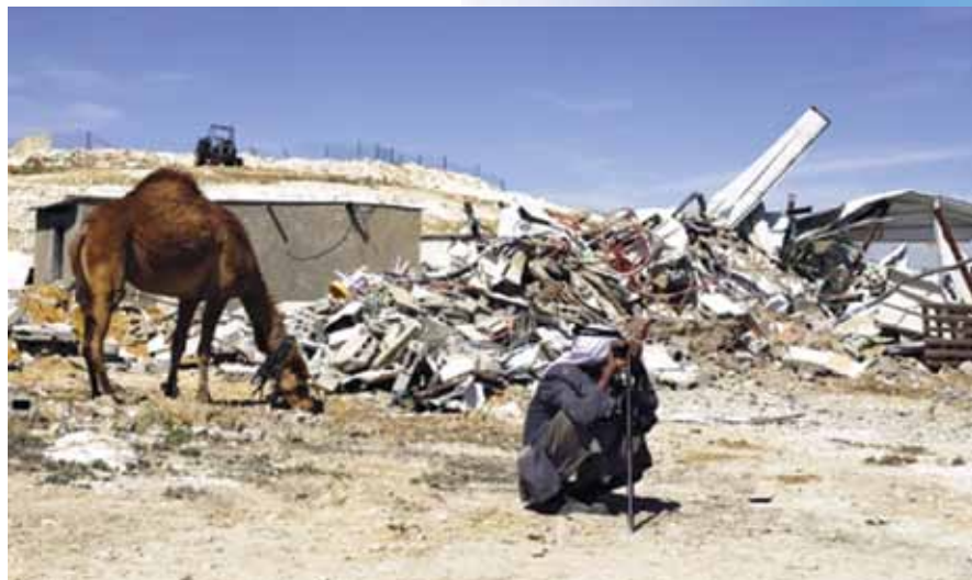
Unrecognized Bedouin village in the Negev