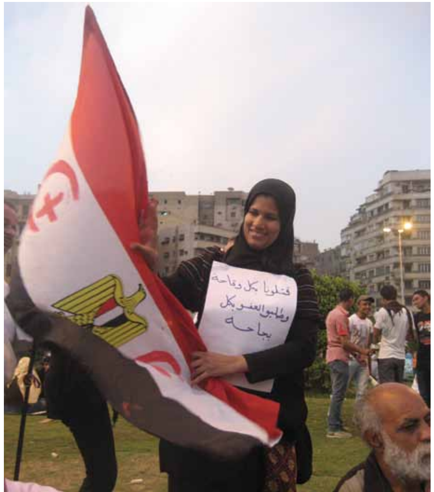
Tahrir Square (Cairo), May 2011

Yet, the young people’s protest would not have developed into a popular uprising, if it had not been joined by other social sectors, including many who are not connected to Facebook, do not read emails, and do not have mobile phones. Millions participating in the uprising expressed their dissent by “traditional” means: They marched on foot; shouted with hoarse throats: “The people want the fall of the regime”; thousands were killed; and huge sums of money are required to fix the damage caused to infrastructure and property. The brutal repression turned in a horrifying manner into a major factor that widened the resistance camp. In the eyes of the general public, the repressive measures employed by the security forces proved above all that the regime and its leaders lost their legitimacy.