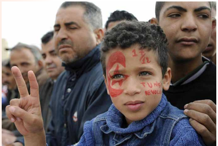
Arab civil protest 2012

T he civil uprising that erupted in the beginning of 2011 marks a turning point in the history of the modern Middle East. The slogan "The people want the fall of the regime" continues to reverberate throughout the Middle East, and in some of its centers the uprising is already generating a variety of changes in various areas. The establishment of post-authoritarian regimes is the most complex challenge that the revolutionaries are currently facing. This historical process poses also