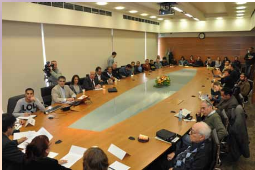
Naguib Mahfouz's Conference