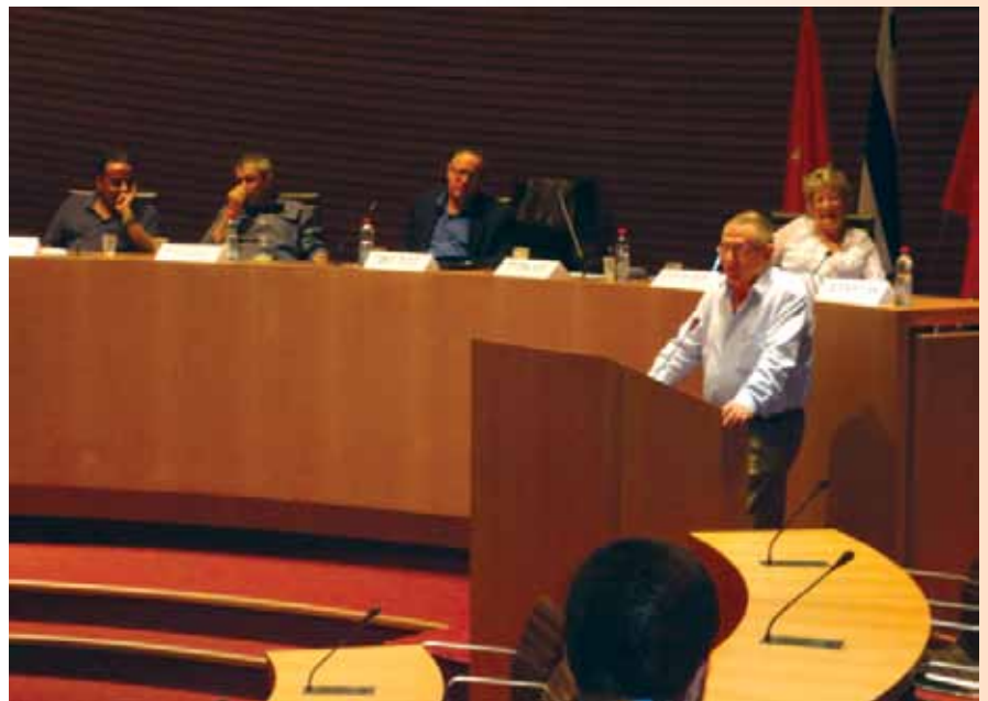
The Arab Spring Panel

The panels were open to students and university staff who filled the Senate Hall well beyond capacity. Senior scholars