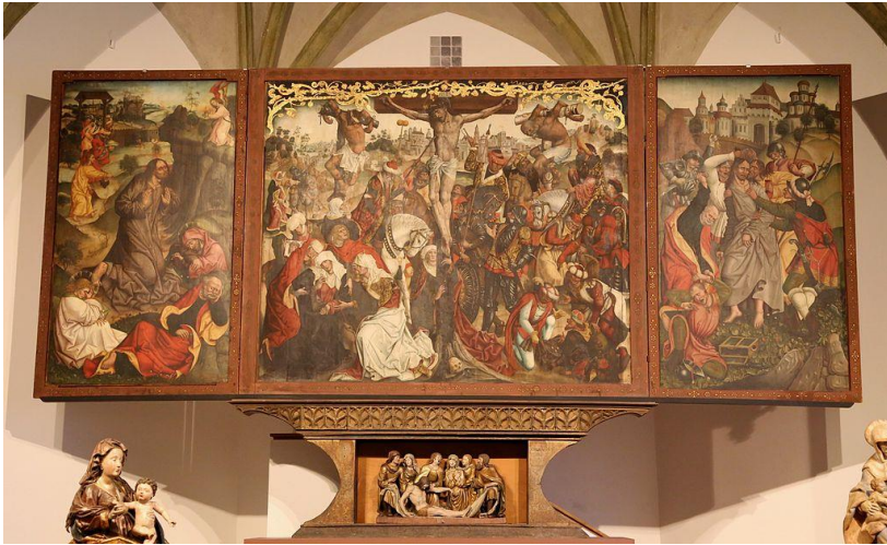
Fig. 1: Jan Polack, Altarpiece of St. Peter , 1492, oil on wood, 235 x 279 cm, Bayerisches National Museum, Munich