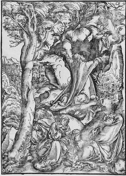
<Fig. 8: Lucas Cranach the Elder, The Agony in the Garden , 1502, Woodcut, 39 x 28.2 cm, The Metropolitan Museum of Art, New York