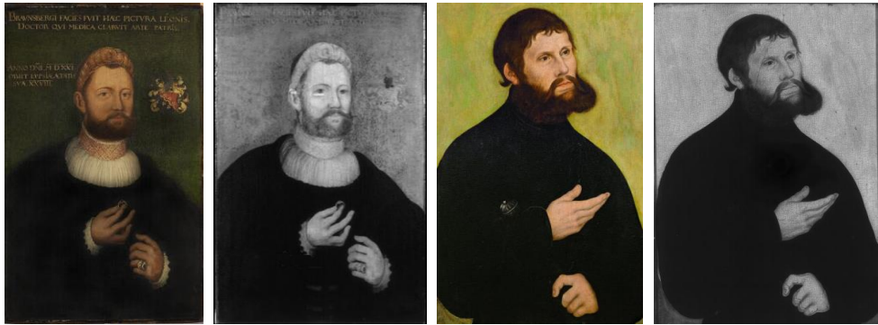
<Figs. 29-30: Lucas Cranach the Elder, Portrait of Leon Braunsberg and IRR , 1521, oil on panel, 63 x 40 cm, Musées royaux des Beaux-Arts de Belgique, Brussels