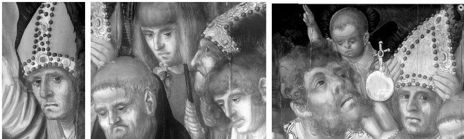
Figs. 21-23: Lucas Cranach the Elder, IRR of The Fourteen Helpers in Need , c. 1505-1508, fluid black pigmented medium, brush, 84.3 x 117.8 cm, Ev. Kirchgemeinde St. Marien, Torgau