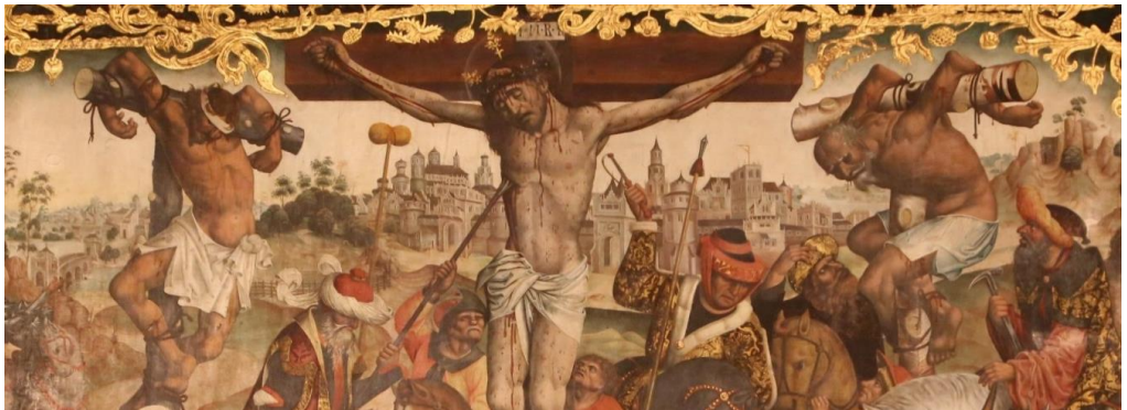
Fig. 2: Jan Polack, Altarpiece of St. Peter (detail), 1492, oil on wood, 235 x 279 cm, Bayerisches National Museum, Munich