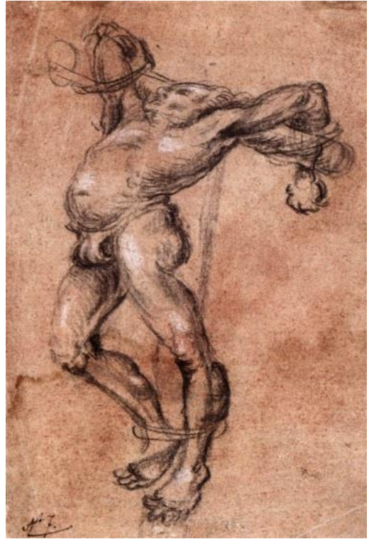
>Fig. 4: Lucas Cranach the Elder, Thief on the Cross, facing Left , 1502, Charcoal with white highlights on red-toned paper, 21.5 x 12.8 cm, Staatliche Museen, Berlin