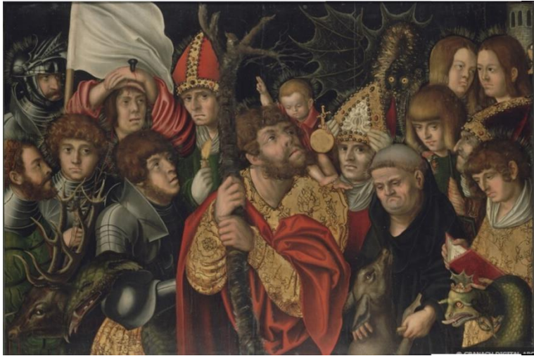
Fig. 20: Lucas Cranach the Elder, The Fourteen Helpers in Need , c. 1505-1508, oil on panel, 84.3 x 117.8 cm, Ev. Kirchgemeinde St. Marien, Torgau