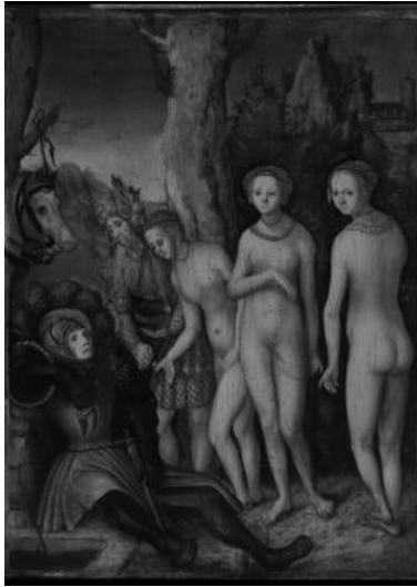
>Fig. 25: Lucas Cranach the Elder, IRR of The Judgement of Paris , 1512, fluid black pigmented medium, brush, 43 x 32.2 cm, Kimbell Art Museum, Fort Worth