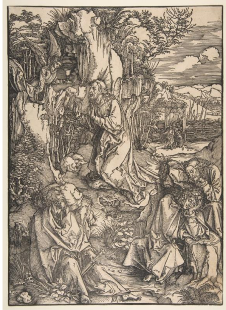
>Fig. 9: Albrecht Dürer The Agony in the Garden , n.d., Woodcut, The Metropolitan Museum of Art, New York