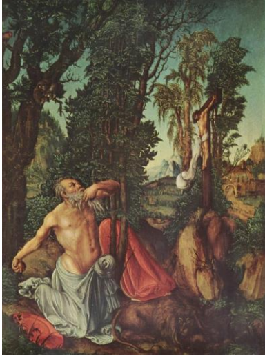
<Fig. 12: Lucas Cranach the Elder, The Penitent St. Jerome , 1502, oil on wood, 55.5 x 41.5 cm, Kunsthistorisches Museum, Vienna