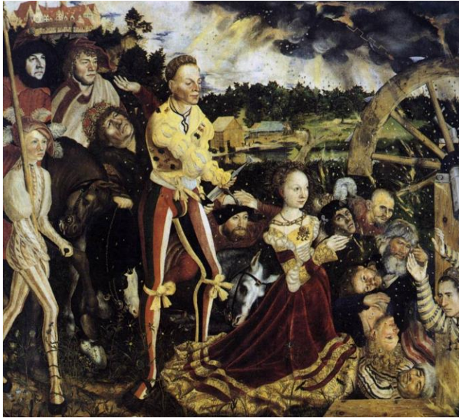
Fig. 19: Lucas Cranach the Elder, Altarpiece with the Martyrdom of St. Catharine - detail of central panel, 1506, oil on wood, 127 x 269.9 cm, Staatliche Kunstsammlungen Dresden