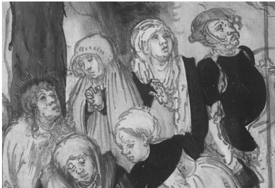
Figs. 14-15: Lucas Cranach the Elder, detail IRR of The Crucifixion of Christ , about 1500, fluid black pigmented medium, brush, 58.5 cm x 45 cm, Kunsthistorisches Museum, Vienna