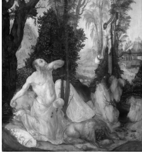
>Fig. 13: Lucas Cranach the Elder, IRR of The Penitent St. Jerome , 1502, fluid black pigmented medium, brush, 55.5 x 41.5 cm, Kunsthistorisches Museum, Vienna