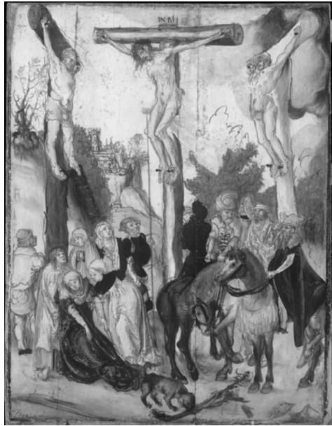
>Fig. 11: Lucas Cranach the Elder, IRR of The Crucifixion of Christ , about 1500, fluid black pigmented medium, brush, 58.5 cm x 45 cm, Kunsthistorisches Museum, Vienna