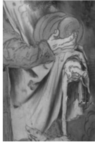
<Fig. 16: Lucas Cranach the Elder, detail of IRR of The Lamentation of Christ , 1503, fluid black pigmented medium, brush, 138 x 98.3 cm, Alte Pinakothek, Munich