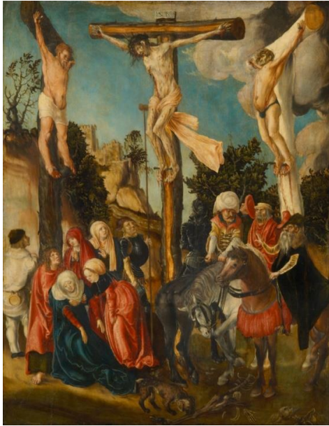
<Fig. 10: Lucas Cranach the Elder, The Crucifixion of Christ , about 1500, Oil on Wood, 58.5 cm x 45 cm, Kunsthistorisches Museum, Vienna