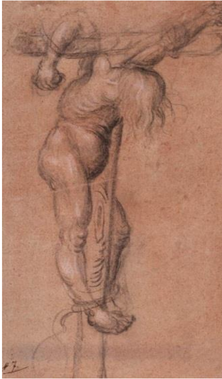
<Fig. 3: Lucas Cranach the Elder, The Good Thief on the Cross , 1502, Charcoal with white highlights on red-toned paper, 22.6 x 12.1 cm, Staatliche Museen, Berlin