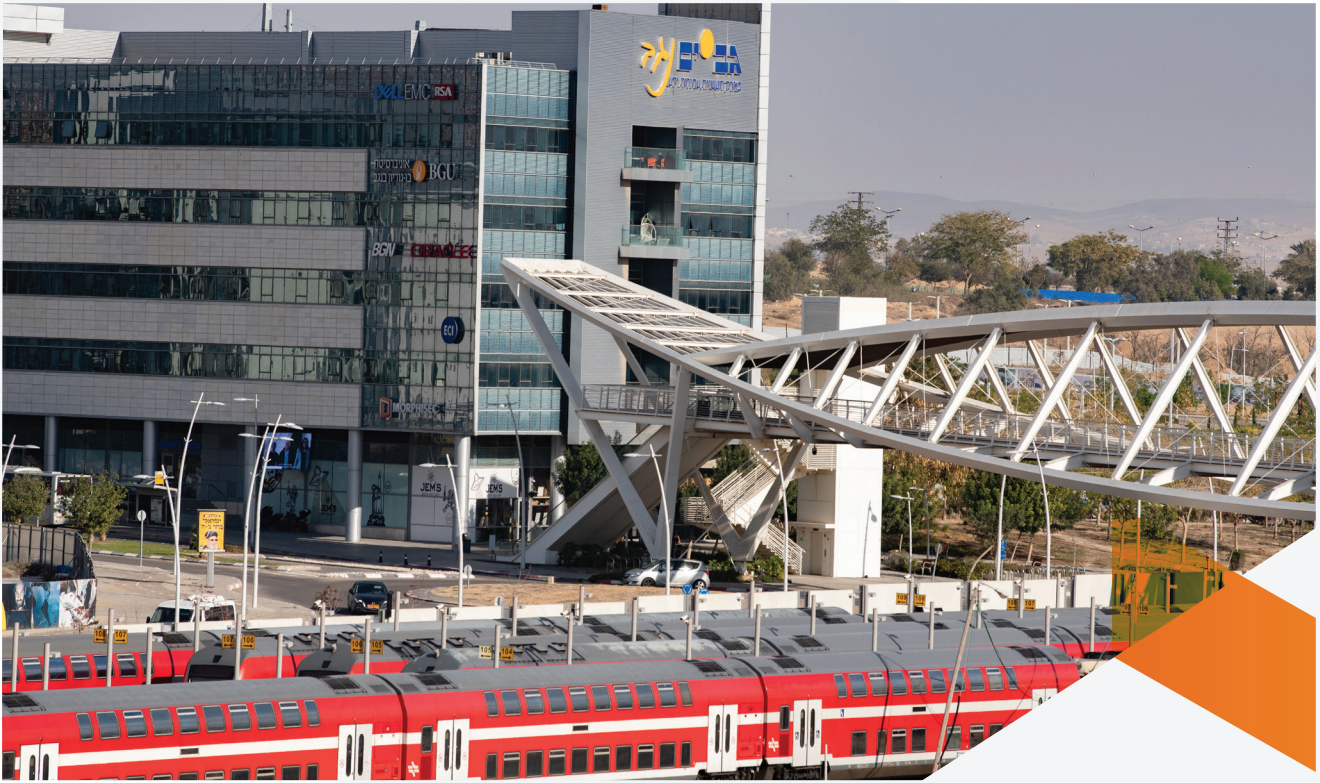
BGU's Hi-Tech Park, part of the ecosystem surrounding the Marcus Family Campus