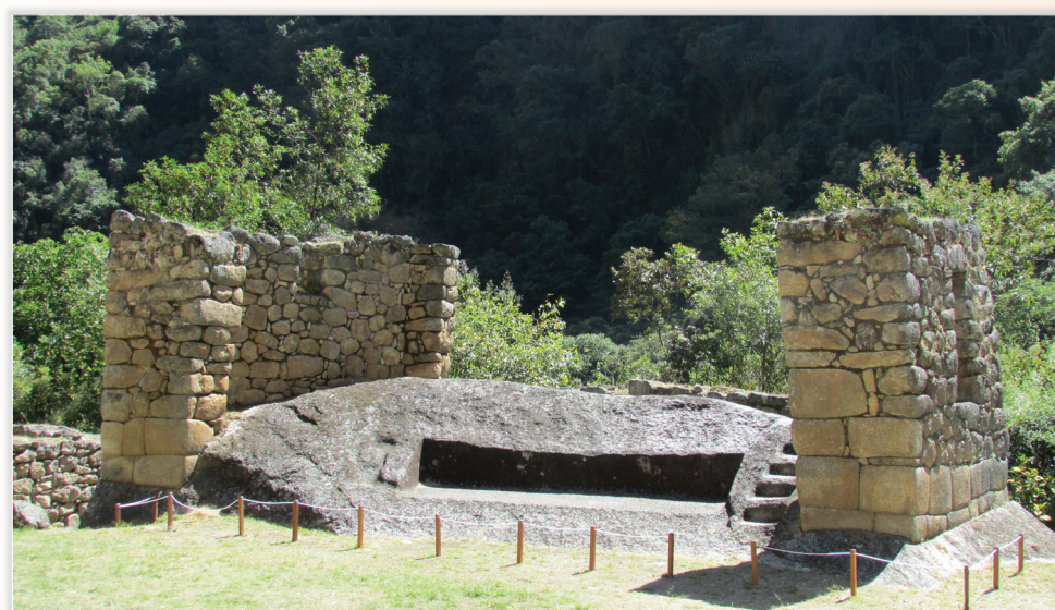
Inca Sanctuary of Chachabamba