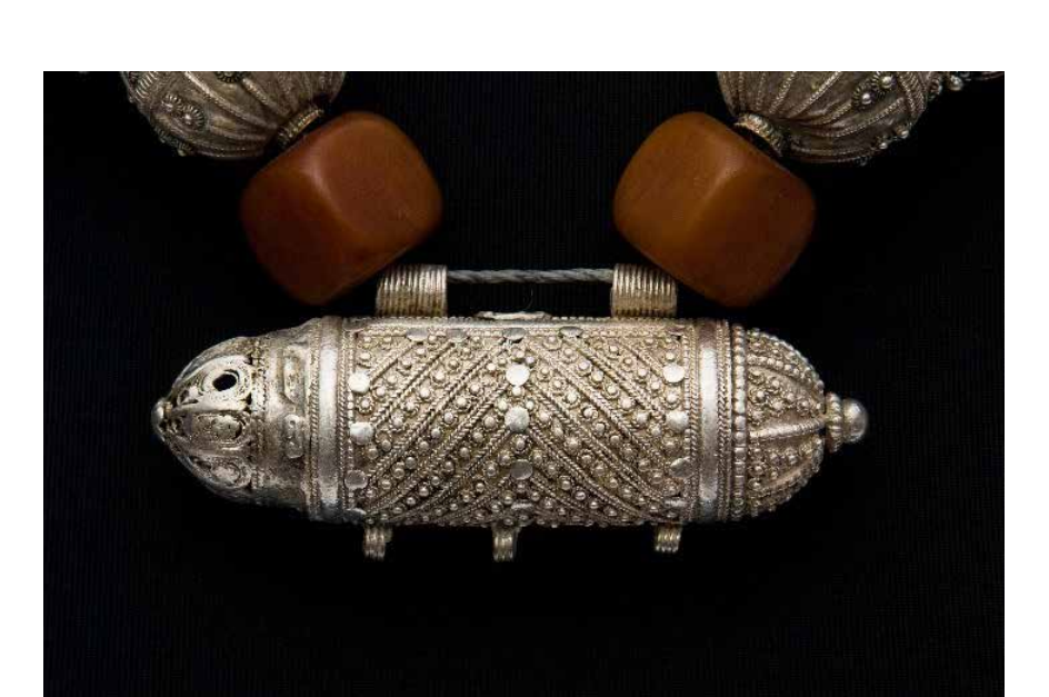
Figure 1. An amulet case (kitāb, ḥirz in Arabic), twentieth-century Yemen.

the materiality of the pendant that repelled demons or the evil eye.<sup>4</sup> The use of silver and other metals, the fashioning of shiny round surfaces called lumah , and danādil in Arabic, or the sound of silver bells contributed to the perception of the pendant as an amulet (Abdar 2019, 96–97). Indeed, many craftworkers made their amulet cases sealed and without intention of enclosing a parchment (figure 1). The Jewish artisan would make the amulet case, while the wise man would inscribe the amuletic charm. If the amulet was a silver plaque, these two roles were sometimes carried out by one person (Abdar 2019, 36). In both cases, the materiality of the amulet case was mediated by Jews who were usually the only ones practicing silversmithing.<sup>5</sup>