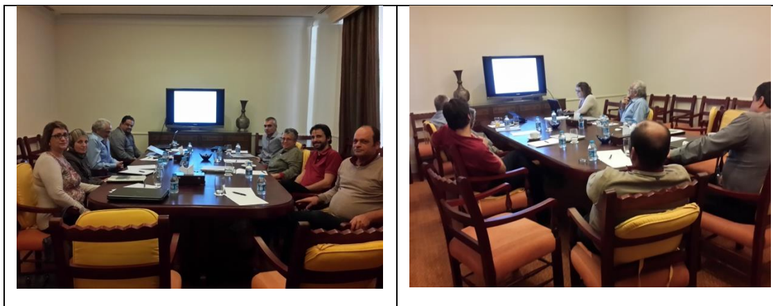
Fig. 1: AGRISOL kickoff meeting at the Movenpick Hotel, Aqaba, Jordan

The researchers presented their respective institutions, and then moved to discuss the activities of the project, in relation to their respective work packages. They review and discuss the optimal design for the two pilot solar desalination plants, timetable of construction, installation and commissioning of the Jordanian pilot desalination plant, planning and setup of the agronomic experiments, crops and management.