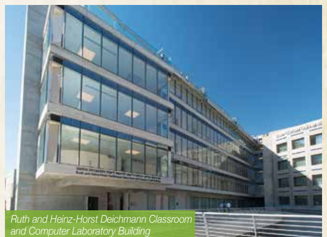
Ruth and Heinz-Horst Deichmann Classroom and Computer Laboratory Building

With nearly 1,500 seats in the building, three large auditoriums, state-of-the-art computer labs and various sized classrooms, the new building provides the University with much needed space to meet both current and future needs, she added.