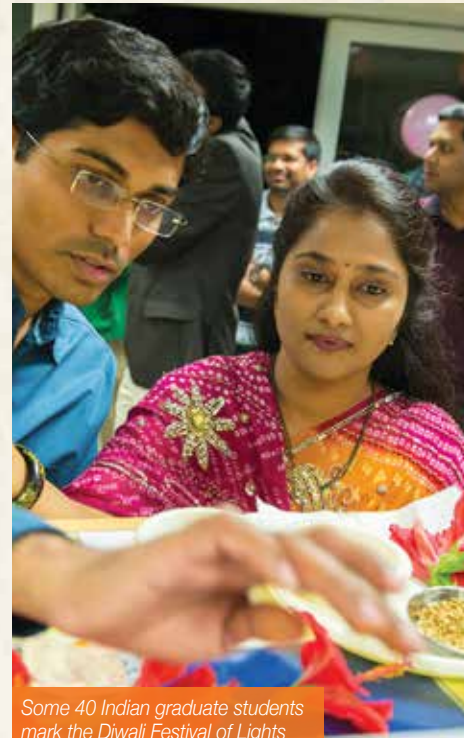
Some 40 Indian graduate students mark the Diwali Festival of Lights