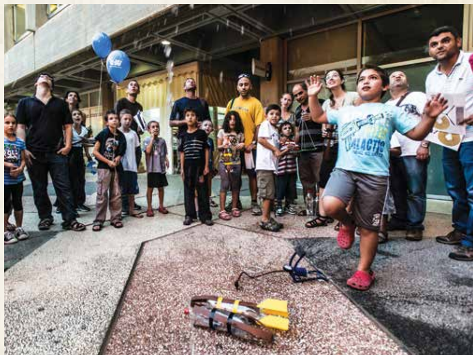
This year's annual Science Night attracted families from around the area who came to experience the fun of learning