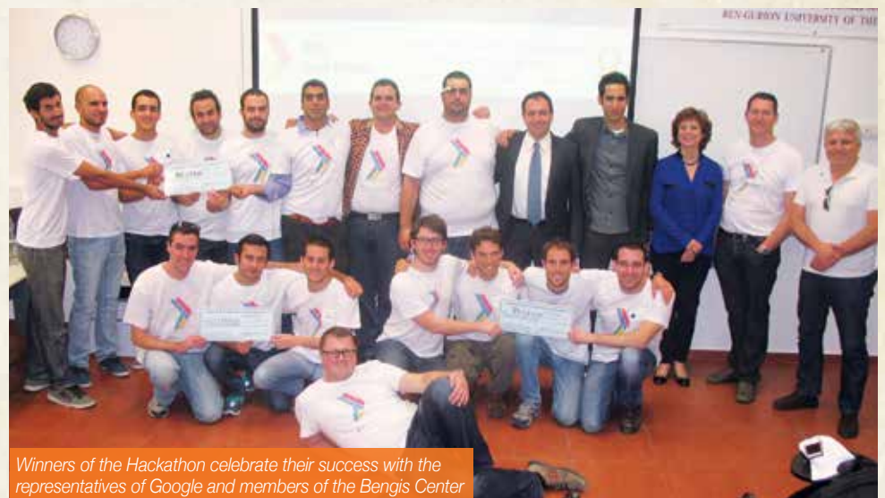
Winners of the Hackathon celebrate their success with the representatives of Google and members of the Bengis Center