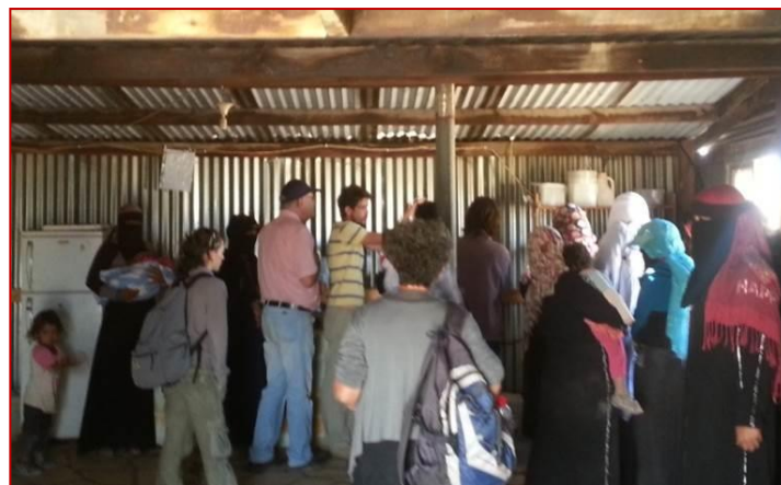
Demonstration of the biogas-operated cooking equipment to the women's group participants

In the photos above, one can see the interest generated by the lectures and demonstrations that were given inside a kitchen, which highlighted subjects such as the importance of cleaning and safe disposals of waste and its effects on health, the value of cooking and heating gas and keeping the food safely fresh in a cold refrigerator, and the technical aspects of operating the kitchen utilities.