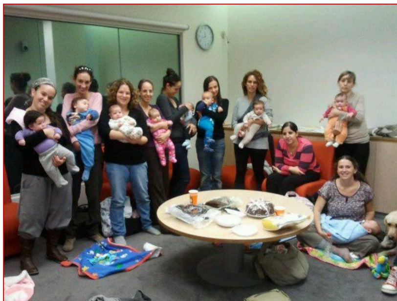
Mom to Mom-Em le Em 2013