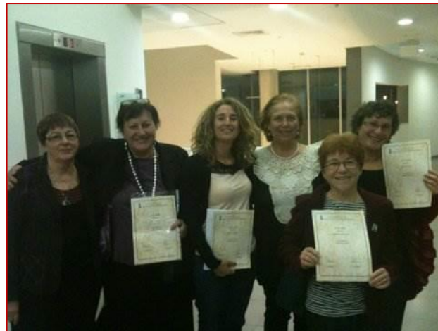
A selection of graduates of the Positive Parenting training program