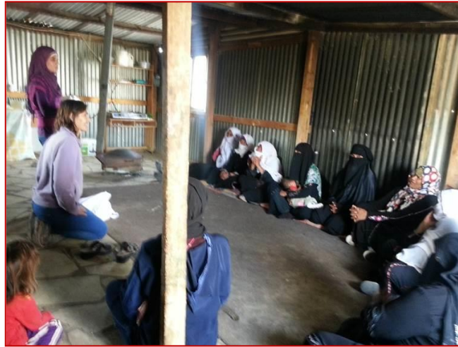
The women's group participants listen to a lecture about the recycling system