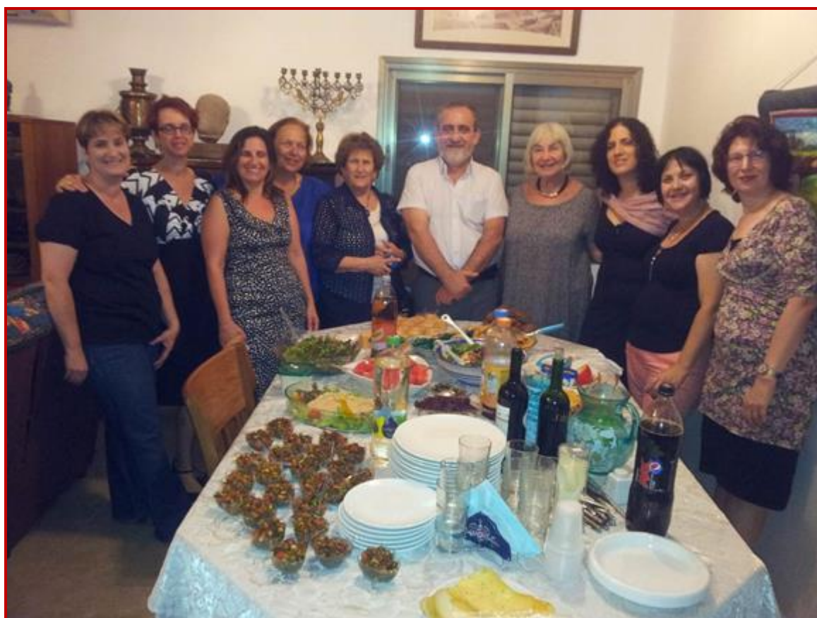
End of Academic Year in Isha Be-Shela