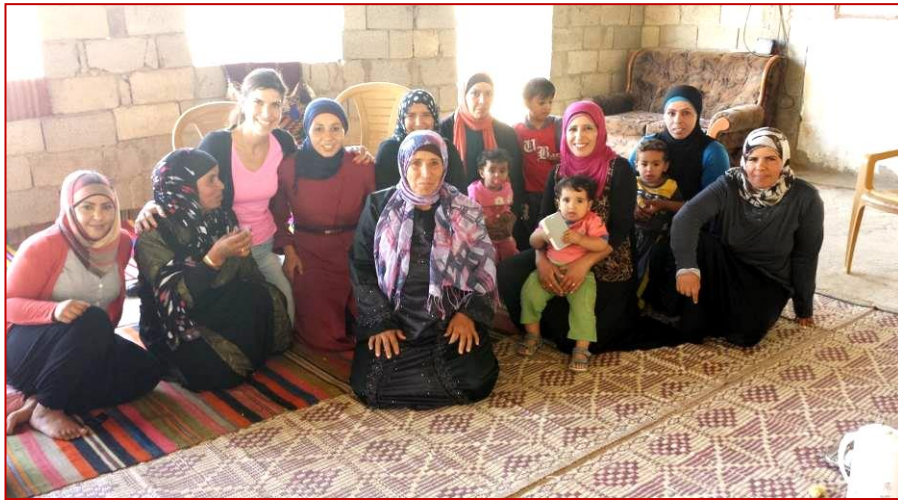
A sample of the participants in the women's environmental education group at the Um Batim site

The group leaders include a Bedouin woman health educator and an educational leader from INPS. The first wave of data on environmental issues and health has been collected for the program evaluation.