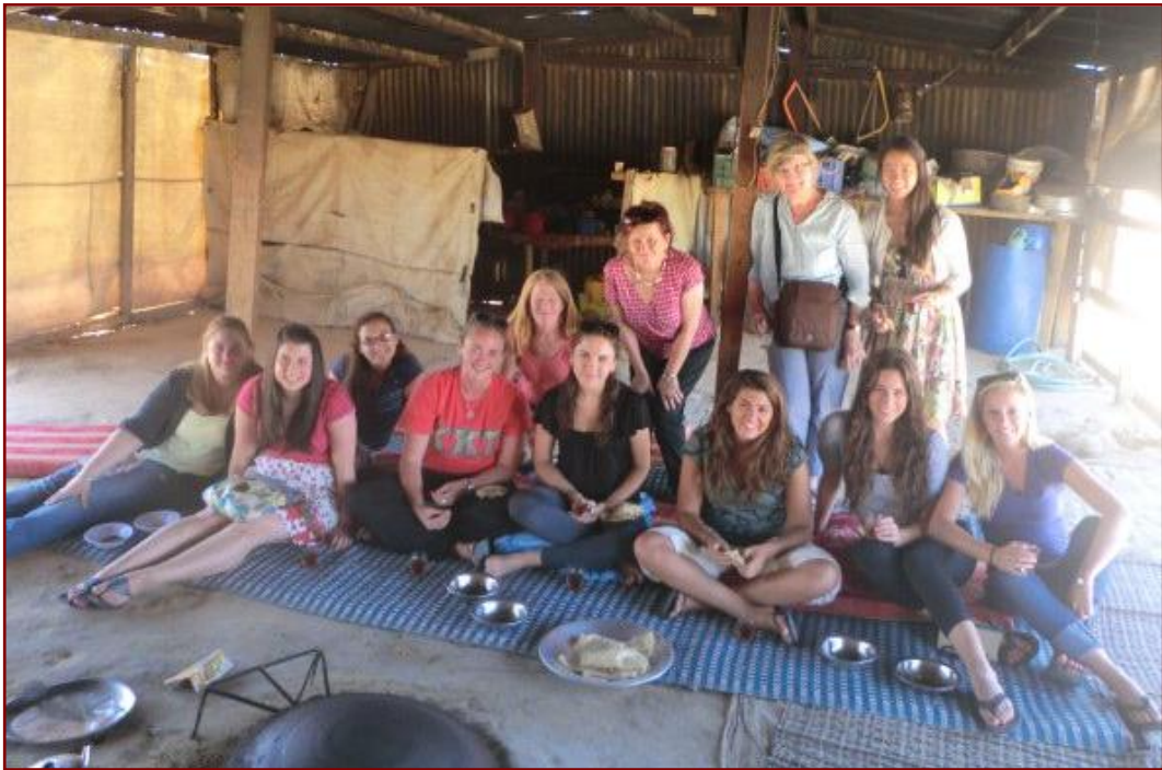
Study group participants visiting a Bedouin home in the Negev