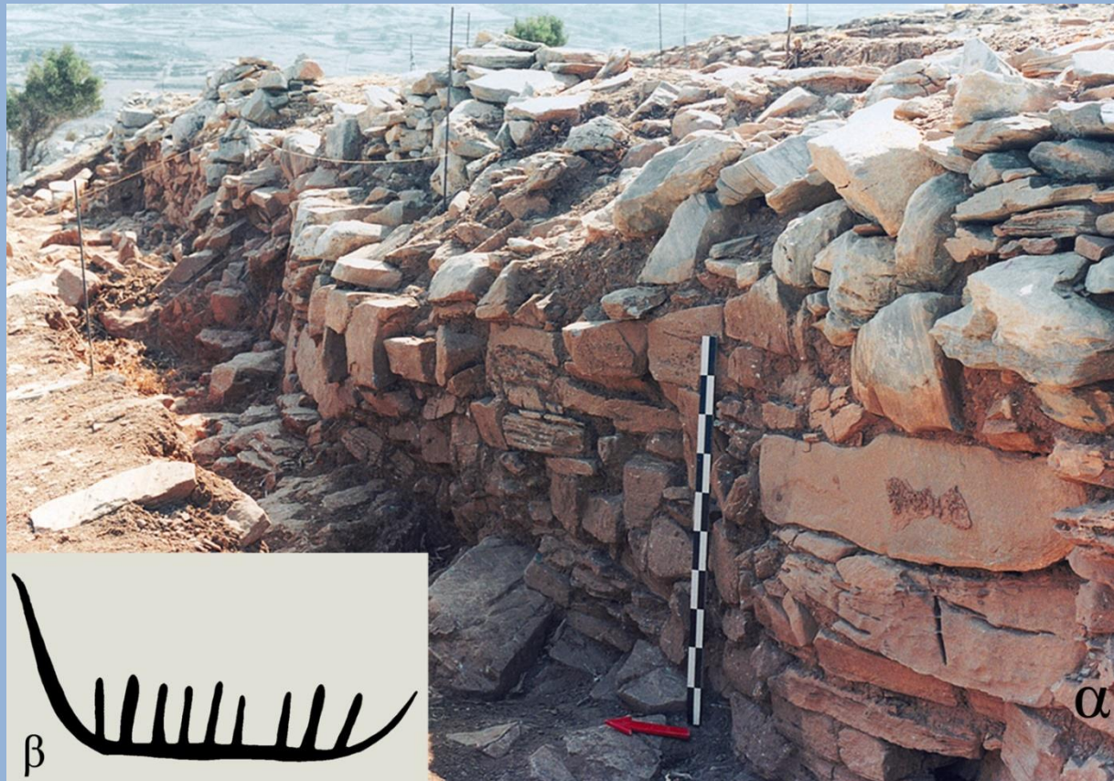
Strofilas' fortification wall, central bastion. Rock art representation of a ship (drawing by C. A. Televantou).