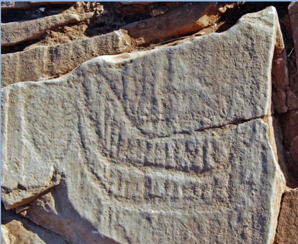
Area of open-air worship: rock art representation of ships.

Various archaeological works will be carried out during July and August (3/7-12/8/2017) (e.g. washing sherds, arranging material, recording, photographing, drawing finds etc.).