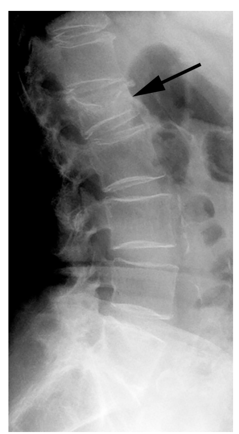
Fig 1 Radiograph showing L1 compression fracture and suggestion of osteopenia but no evidence of metastatic disease